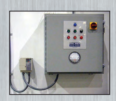
Control panel and VFD included